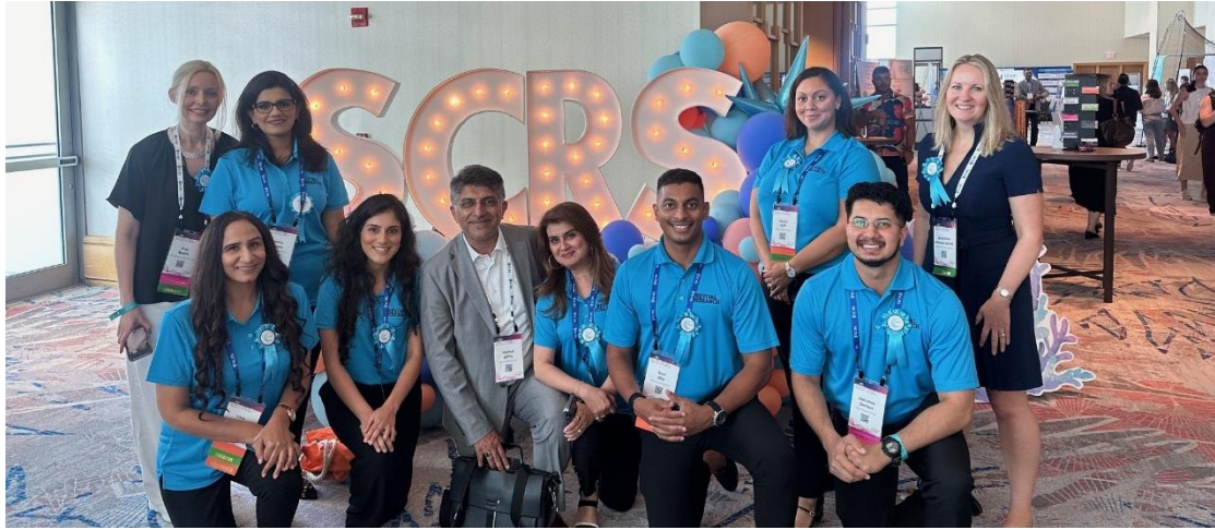
Revive Research Network – Trusted Global Partners for Clinical Research